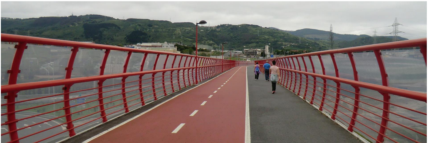
pedestrian bridge with composite steel-concrete structure deck