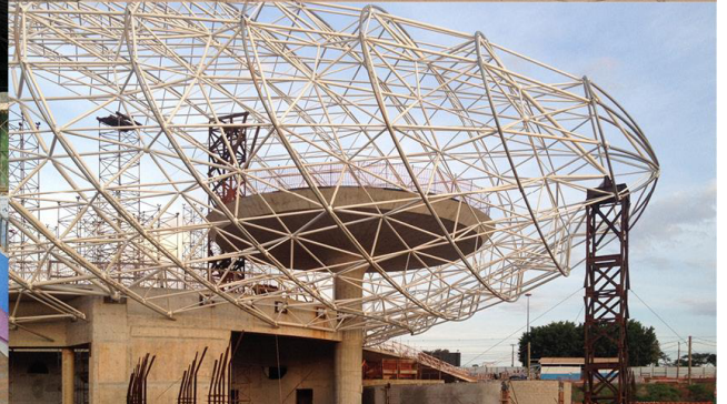
three dimensional steel structure